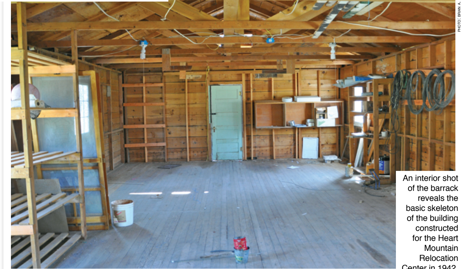
An interior shot of the barrack reveals the basic skeleton of the building constructed for the Heart Mountain Relocation Center in 1942.