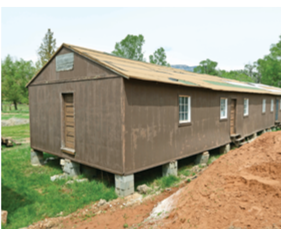
This Heart Mountain barrack is currently located outside of Shell, Wyo., on an Iowa State University geology field studies camp. The historic structure will be moved to the Heart Mountain World War II Japanese Confinement Site between Cody and Powell, Wyo., this summer.