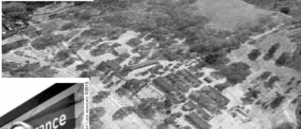
An overlay of Tuna Canyon from L.A. City archives