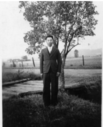
Young Gordon Hirabayashi standing by a tree

During World War II, when more than 120,000 Americans of Japanese ancestry were forcibly removed from their homes and communities solely because of their ancestry, Gordon Hirabayashi took a principled stand. While a student at the University of Washington, Hirabayashi defied the U.S. government's mass incarceration of Japanese Americans because it was racially discriminatory and violated his rights as a U.S. citizen. After spending time in prison, Hirabayashi lost his case in an infamous Supreme Court decision in which government actions were upheld on the grounds of military necessity. Forty years later, Hirabayashi won vacation of his wartime convictions based on new evidence that proved government misconduct and discredited the military necessity of the Japanese American incarceration. Hirabayashi died on Jan. 2, 2012. Later that year, President Barack Obama posthumously awarded Hirabayashi the Presidential Medal of Freedom, our nation's highest civilian honor, for his courageous stance against an unjust law.