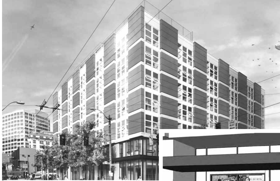
A rendering of Hirabayashi Place

Public art and education installations, collectively referred to as the Legacy of Justice at Hirabayashi Place project, will enlighten visitors about Hirabayashi's courageous