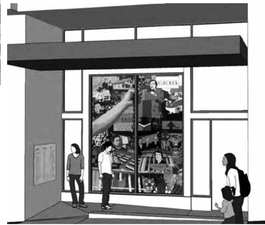
Building entry rendering showing the painting by Roger Shimomura

childhood at Minidoka Incarceration Camp in Idaho.