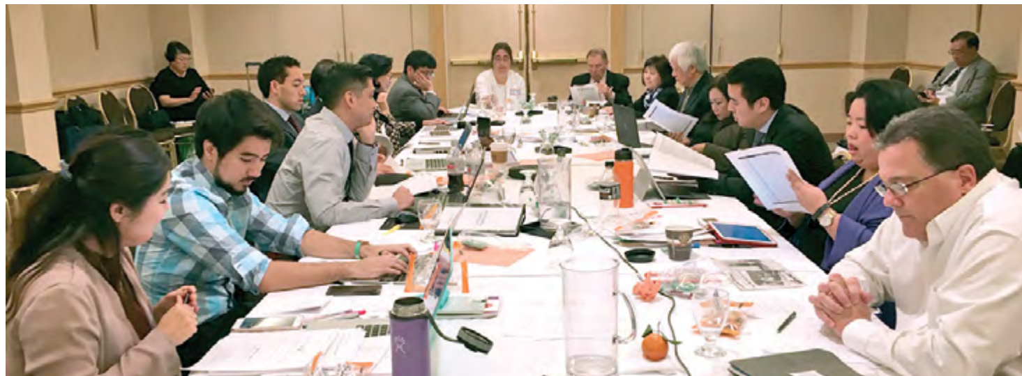
JACL National Board members convened over the budget deficit, looking to make cuts and resolve financial difficulties before the National Convention and upcoming election nears in July.

Budget reductions were made across many programs. Motions were approved cutting