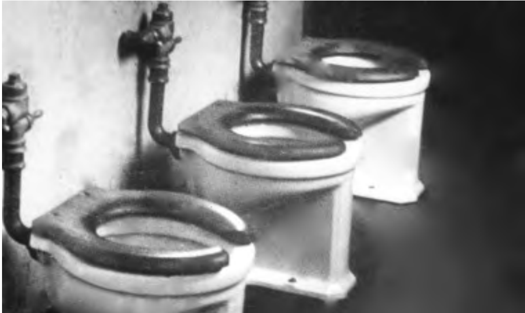
A historic photograph of toilets in one of the latrines at the Manzanar concentration camp during World War II