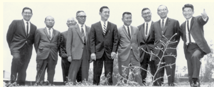
Keiro’s founders in 1961 envisioned the center’s mission: “to enhance the quality of senior life in our community.”