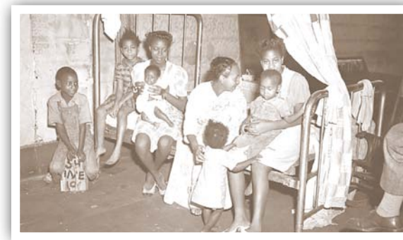
(Top) A family living in Bronzeville, circa 1940s