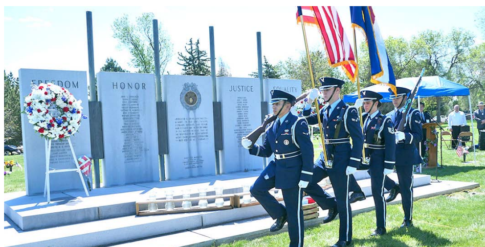
The Japanese American Community Memorial Day Service at the Nisei War Memorial at Denver's Fairmount Cemetery