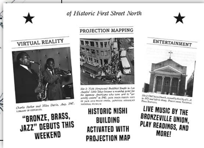
(Left) An excerpt from the Bronzeville-Little Tokyo newspaper for the LAAPFF

Interestingly, Little Tokyo was not the only case in which African-Americans began inhabiting Japantowns during WWII. The California State Division of Immigration and Housing states in its 1943-44 Biennial Report, "Negroes are moving into the deserted Japtown districts of our metropolitan centers in vast numbers, and conditions of sanitation are generally poor, and overcrowding is a major difficulty. . . . We have succeeded in cleaning out several of the smaller abandoned Japtown districts throughout California, and through abatement and misdemeanor prosecutions, we have had a large number of old dilapidated frame shacks razed to make way for new buildings."