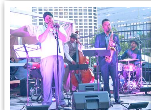
A live jazz performance was featured on the steps of the Old Union Church.