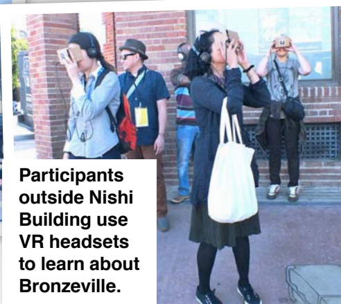
Participants outside Nishi Building use VR headsets to learn about Bronzeville.