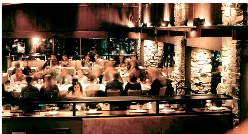
An interior view of the dining room at Canlis