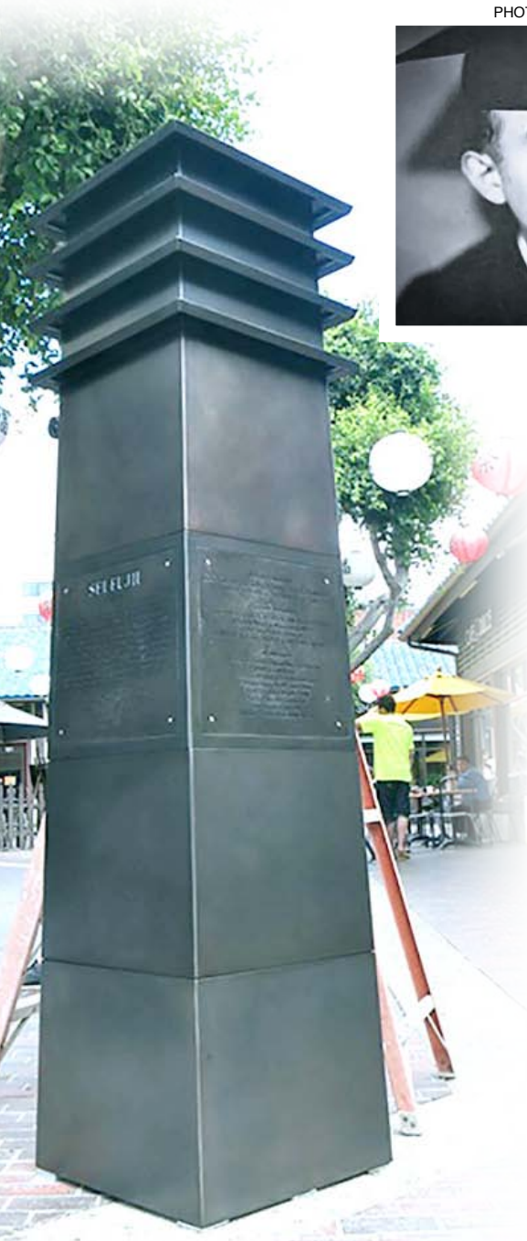
A lantern monument to commemorate the life and legacy of Sei Fujii was dedicated in Little Tokyo in August 2015.

In 2015, a galvanized steel monument to honor Fujii's life and legacy was permanently erected in Little Tokyo at the former site of the Kashu Mainichi , a Japanese daily newspaper for which Fujii served as its publisher. The lantern, located on Second Street at the entrance to the Japanese Village Plaza, was designed by Miles Endo of Studio Endo. ■