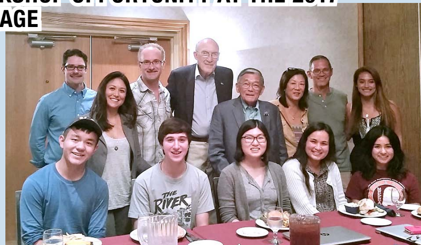
The Hon. Norman Mineta and Sen. Alan K. Simpson (center) with the National Japanese American Memorial Foundation leadership and scholarship students and Digital Storytelling Workshop instructors and teaching assistants.