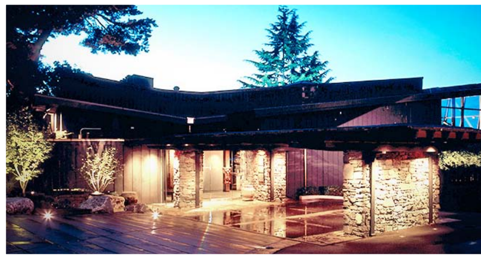
Offering breathtaking views of Seattle, Lake Union and the Cascade mountain range, Canlis has called Seattle home for 66 years.