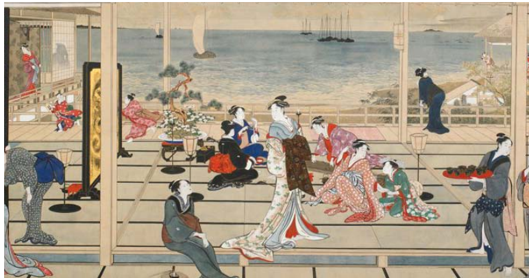
Artwork by Japanese artist Utamaro is currently on display at the Smithsonian Sackler Gallery until July 9.