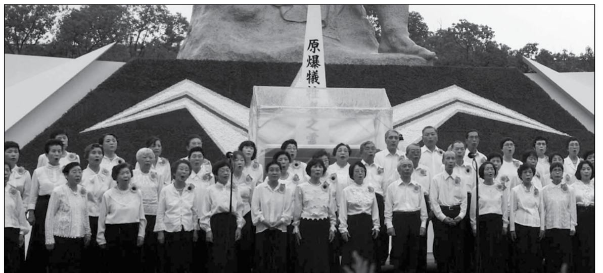
As in past years at the Nagasaki bombing ceremony, a bell rang out in a prayer for peace, and bomb victims who were children during the attack sang a song called "Never Again."