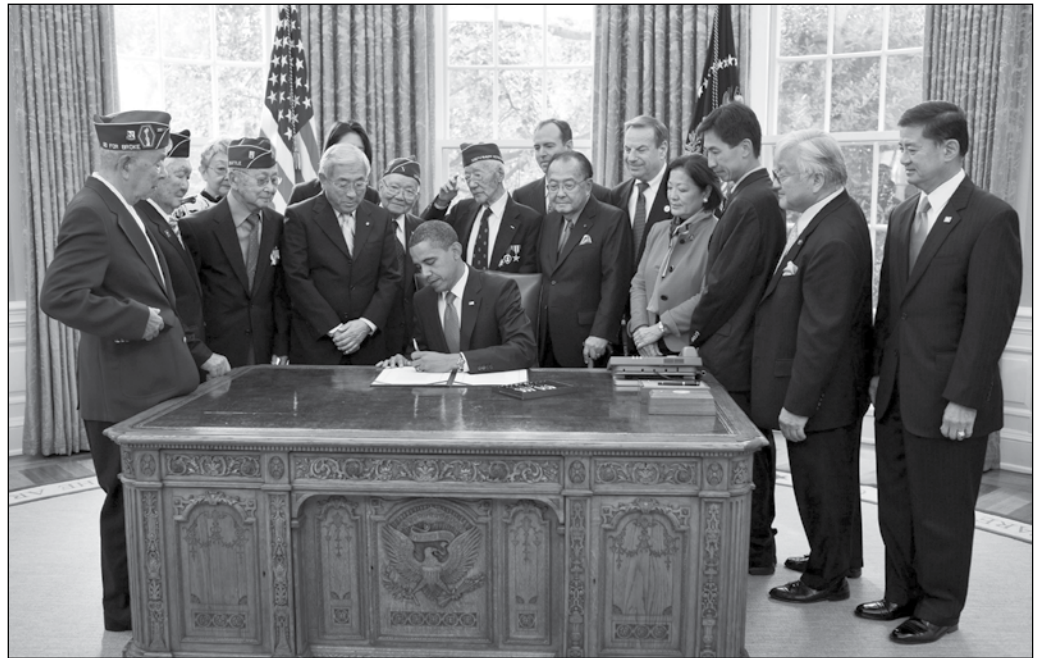
Last October, President Barack Obama hosted six veterans and their supporters at the Oval Office signing ceremony for the Congressional Gold Medal.

On the web: www.nationalveteransnetwork.com