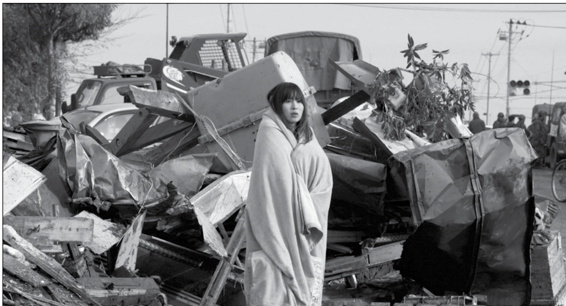
A woman stands in the middle of rubble, looking at the city submerged under water in Ishinomaki in Miyagi Prefecture March 13, two days after the catastrophic earthquake-triggered tsunami hit northeastern Japan.

But Tanaka's wife died the day after the tsunami, and Tanaka still