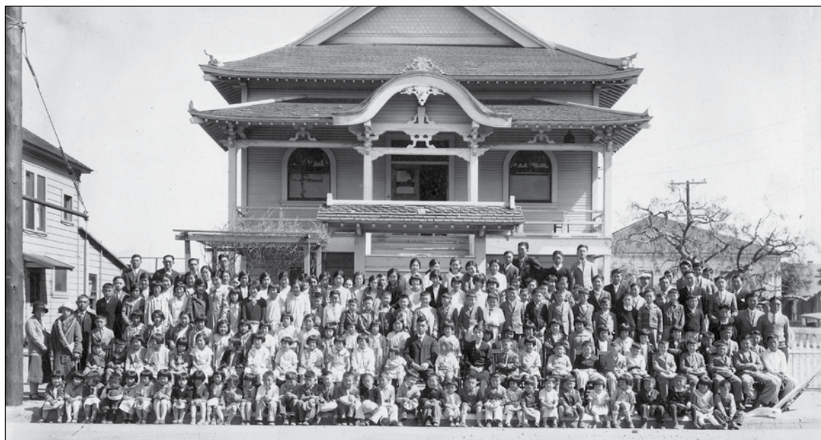
Sunday school kids and members pose in front of the Watsonville Buddhist Temple on March 23, 1930.