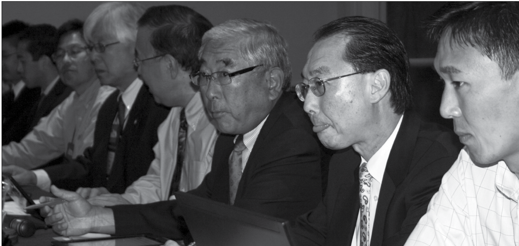
JACL national board members convene at the recent national convention in Los Angeles. High on the agenda was the organization's declining membership.

With a dip in membership and a forecasted budget deficit, JACL leaders discuss the future of the organization and its ability to reach out to the broader Asian American community.