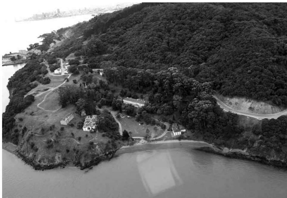
Angel Island Immigration Station was historically the first destination in the United States for many Asian immigrants during the 1920s and 1930s.

The Pew analysis, released June 19, said the tipping point for Asian immigrants likely occurred during 2009 as illegal immigrants