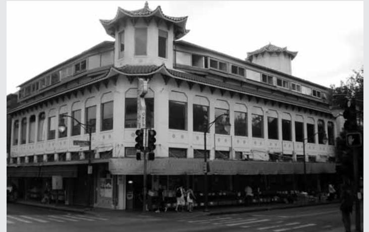
The Wo Fat building in the heart of Honolulu's Chinatown Historic District is listed on the National Register of Historic Places.

HONOLULU—More than half of the security cameras in Honolulu's Chinatown are down, according to Capt. William Axt of the Honolulu Police Department.