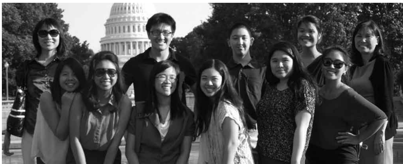
Participants of this year's JACL Collegiate Leadership Conference pose in front of the Capital Building.