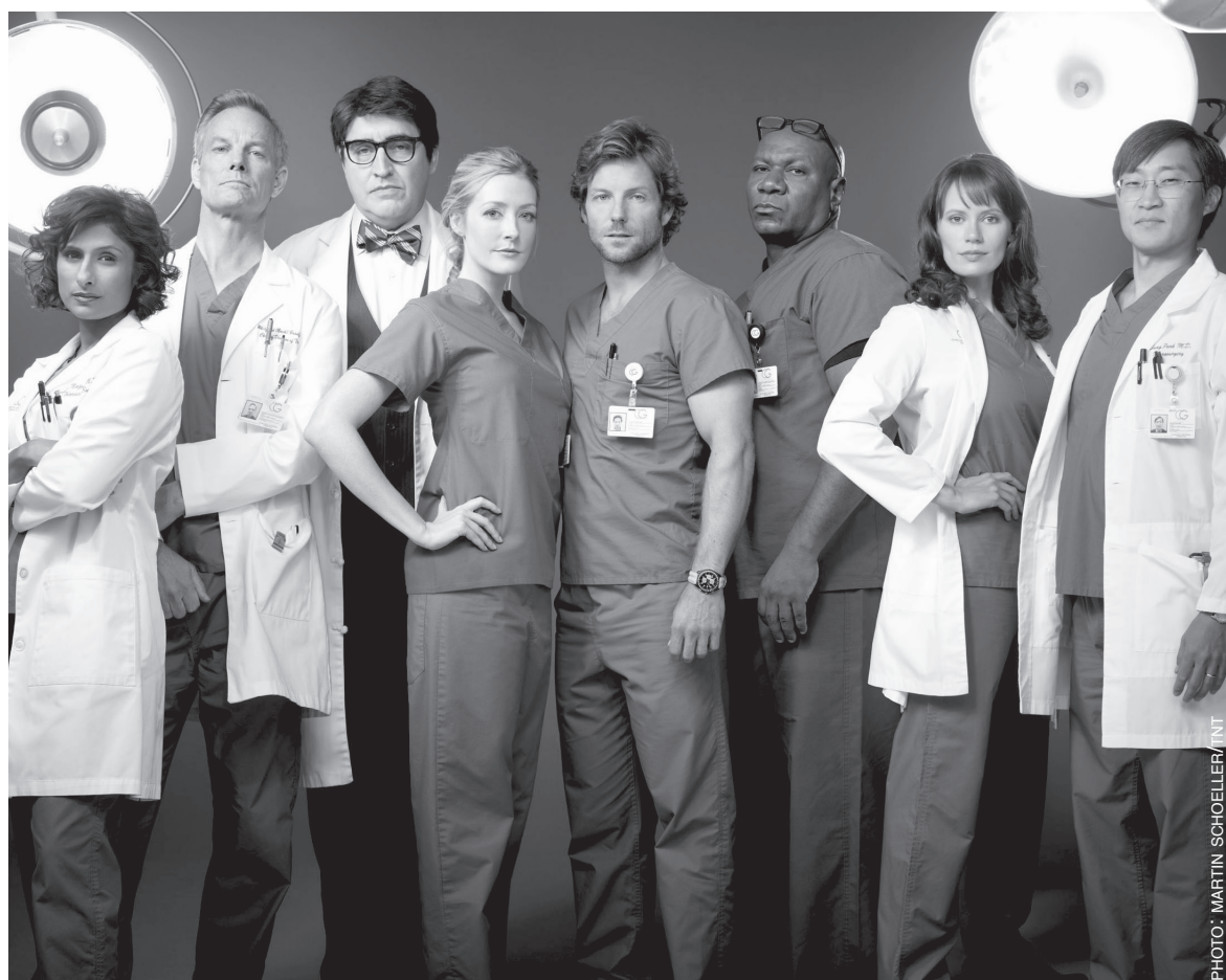
David E. Kelley's drama "Monday Mornings" is based on the novel by Dr. Sanjay Gupta.