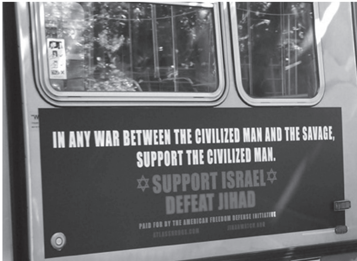
The conservative organization American Freedom Defense Initiative purchased anti-Islam ads in San Francisco after a legal win in New York.

Bus drivers, youth and American Islamic community leaders denounced the ads at the recent public forum.