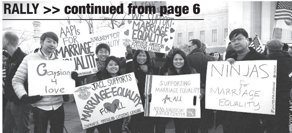
JACL joined the AAJC, NQAPIA and OCA National at the marriage equality rally.

Said Ouchida: "The 10,000-plus members of the Japanese American Citizens League are proud to be here to celebrate the right to love. Japanese Americans felt the sting of what it means to be treated differently — 120,000 men, women and children were imprisoned during World War II. That was wrong. There was a time when this nation outlawed the right of a Japanese immigrant to marry an American. That law was wrong.