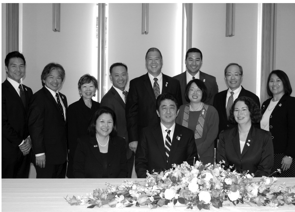
The JALD, led by U.S.-Japan Council President Irene Hirano Inouye ( seated, left ) met with Japan Prime Minister Shinzo Abe ( seated, center ) on March 15 to discuss pertinent issues regarding the U.S.’s relationship with Japan.