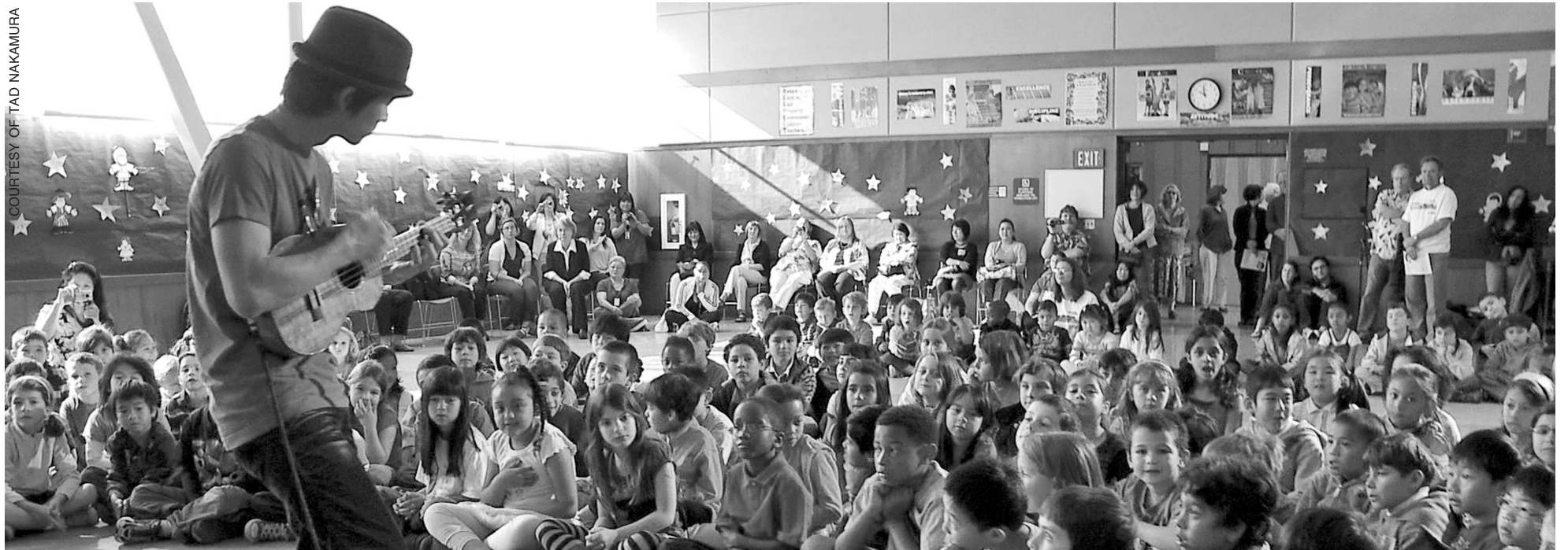
Jake Shimabukuro (pictured left) performs for elementary school children in San Francisco.