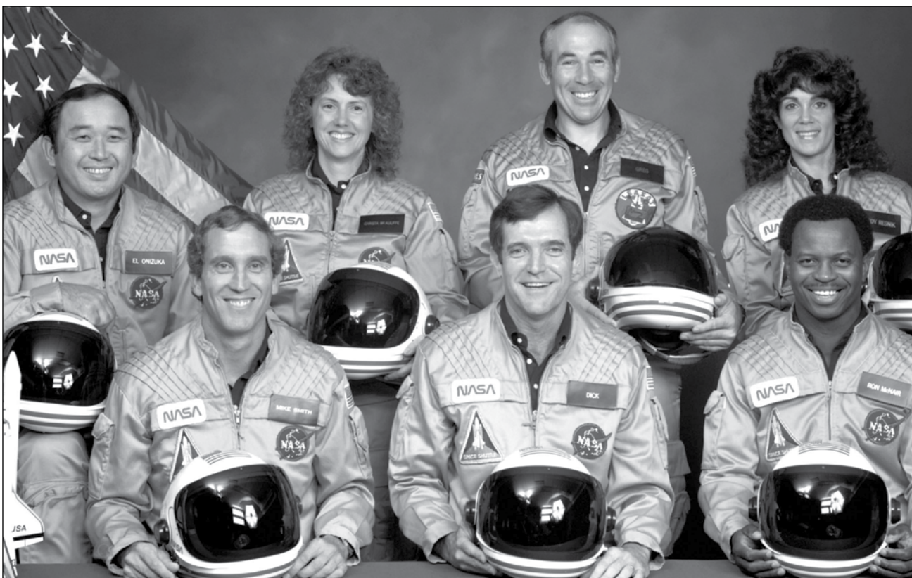
Onizuka (left, back row), 39, told loved ones he wanted to go into space and bring back knowledge for the next generation.

"He often visited my class and inspired the new aerospace engineering students. We have many mementos from when he flew into space and returned to visit us," he added.