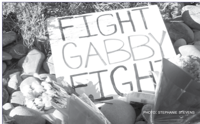
Tragedies like the one in Tucson sink deep into our emotional core.

Death is a mysterious beast, striking from its lair abruptly, seemingly inadvertently.