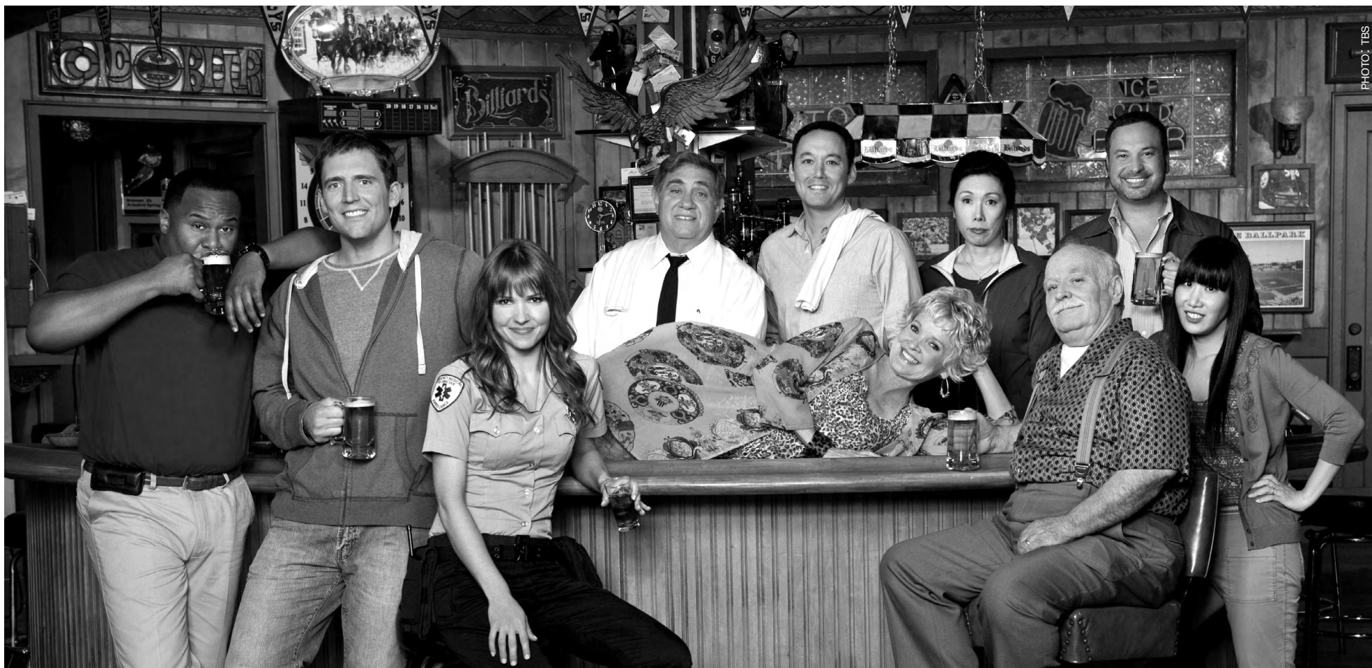
The cast members of "Sullivan & Son" say they enjoy getting together on Sundays for a relaxing BBQ at actor Dan Lauria's home.

Steve Sullivan, a successful attorney who saves and later helps run the Pittsburgh-based bar owned by his Irish American father, Jack Sullivan (Dan Lauria), and Korean American mother, Ok Cha (Jodi Long).