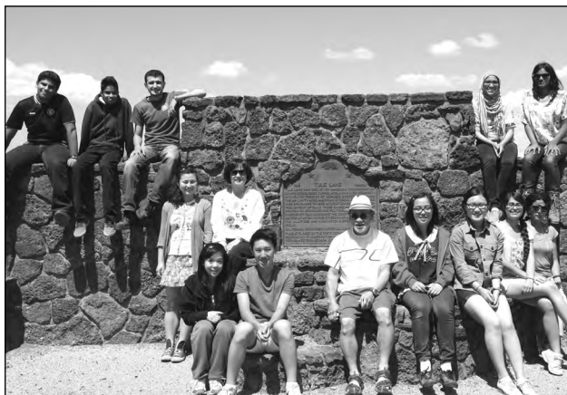
Students and staff of the 2013 Bridging Communities program take a moment in front of the Tule Lake National monument plaque.