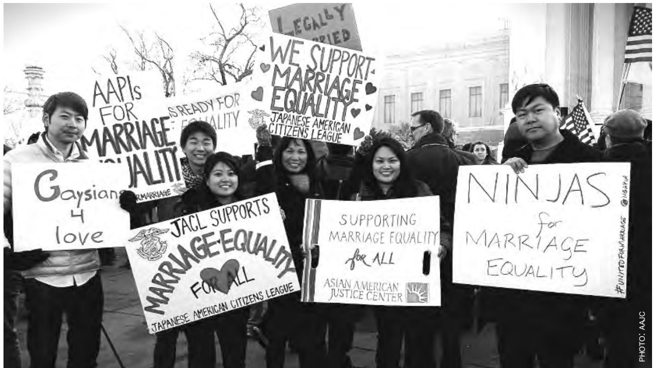
In April, the JACL joined the AAJC, NQAPIA and OCA National at a marriage equality rally in Washington, D.C. The June 26 U.S. Supreme Court rulings on two same-sex marriage cases are being seen as significant steps toward marriage equality for all individuals.

The JACL was the first organization to adopt a resolution in support of marriage equality. The organization has been a