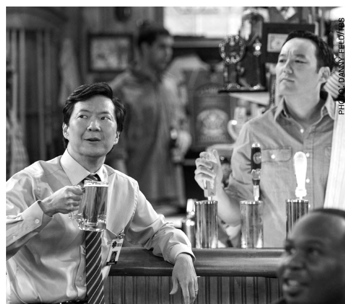
Ken Jeong helped kick off the season two premiere of "Sullivan & Son."