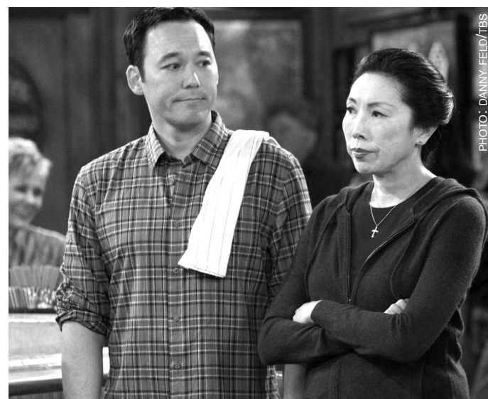
Steve Byrne and Jodi Long play mother and son on the TBS sitcom.

'I try to make the show as appealing as a neighborhood bar would be to anyone. Everybody's welcome. ... It doesn't matter how old you are, how young you are, it doesn't matter what race you are, just as long as you like to laugh.' -Steve Byrne