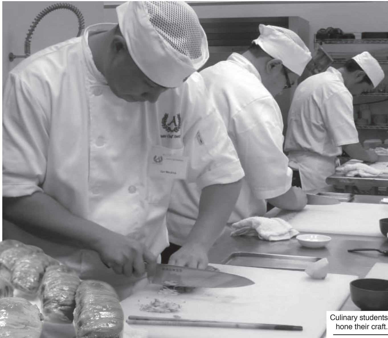
Culinary students hone their craft.

‘This is not very comfortable because it’s such a delicate job making rice and cutting the fish, and (wearing a glove) is not really feeling the small details.’