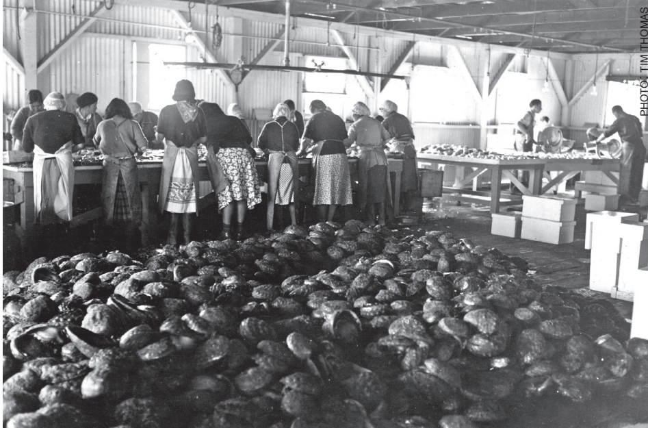
Many Japanese worked in abalone canneries in Monterey, as seen in this photo, circa 1938.