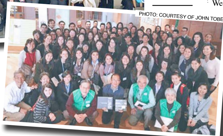
>> Kakehashi Project participants learned about Japanese emigration and the experiences of Nikkei at the Japan Overseas Migration Museum in Yokohama.