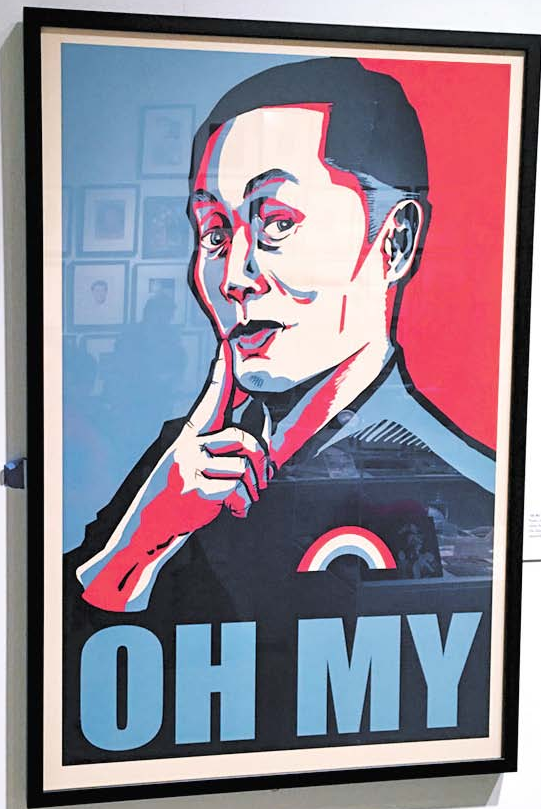
The “Oh My” poster was inspired by Shepard Fairey’s Hope campaign post for President Barack Obama.

More than 200 memorable items from the actor/activist are on display at JANM in a new exhibition.