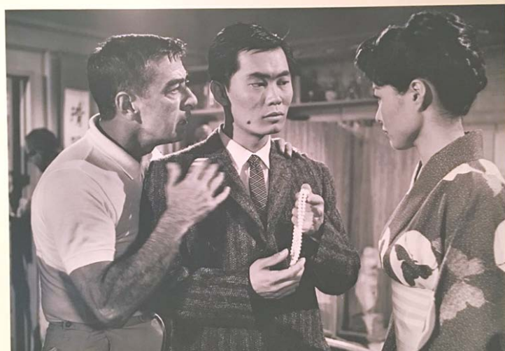
George Takei appeared on the CBS TV show “Perry Mason.”