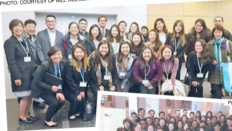
<< A group of Kakehashi Project participants gathered on March 14 for the program orientation.