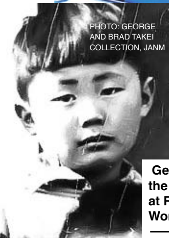
George Takei as a boy in the concentration camp at Rohwer, Ark., during World War II.