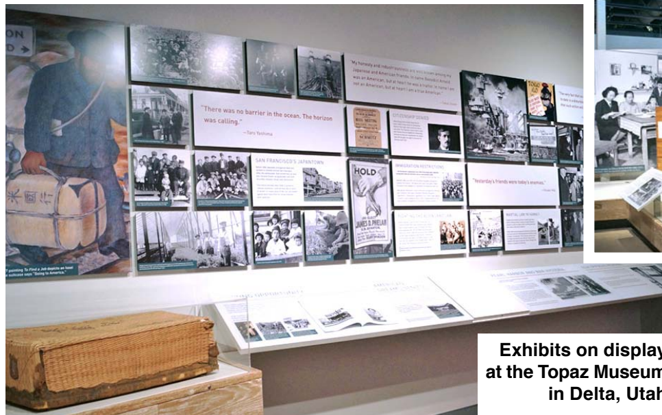
Exhibits on display at the Topaz Museum in Delta, Utah

The museum exhibits recount the toll and complex history that "prejudice, war