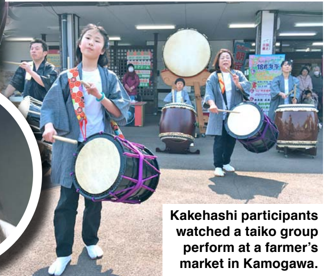
Kakehashi participants watched a taiko group perform at a farmer's market in Kamogawa.

I don't have with most people. Sometimes we lamented, for example, how we wish our parents forced us to attend Japanese language school on Saturday mornings.