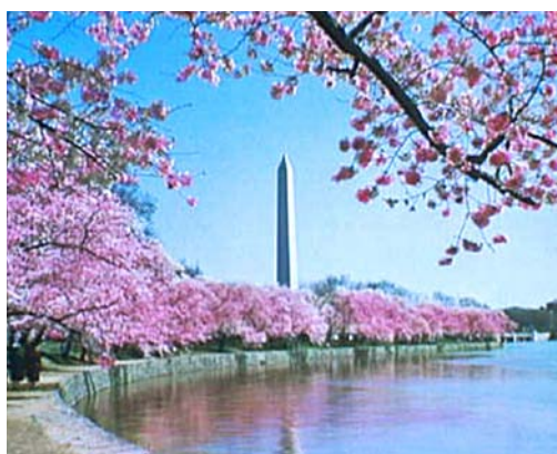
The cherry trees located along the Tidal Basin in Washington, D.C., are expected to be in full bloom the weekend of March 25-26.