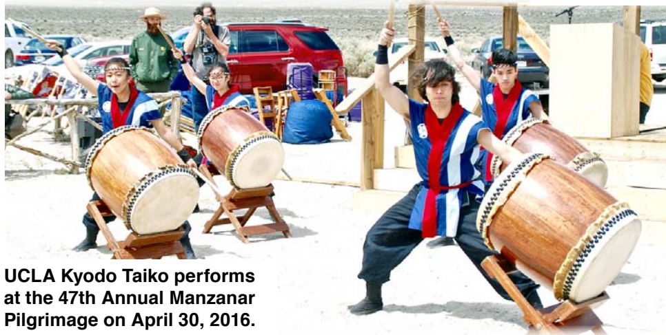
UCLA Kyodo Taiko performs at the 47th Annual Manzanar Pilgrimage on April 30, 2016.

UCLA Kyodo Taiko is comprised entirely of UCLA students. The group has performed annually at local K-12 schools, Nisei Week, Los Angeles Tofu Festival and the Lotus