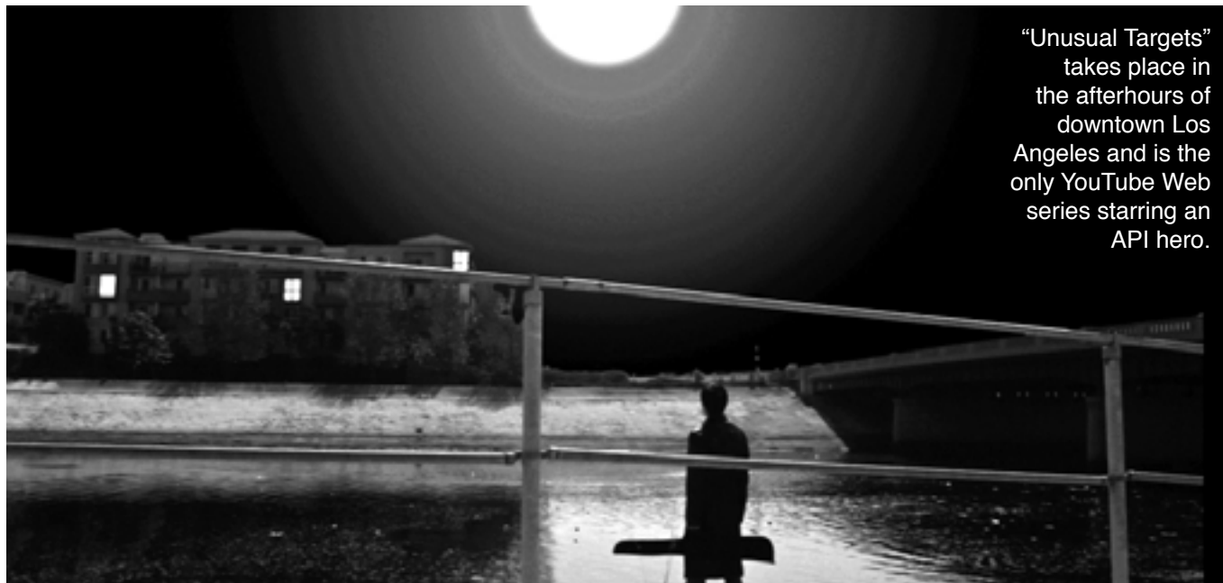
"Unusual Targets" takes place in the afterhours of downtown Los Angeles and is the only YouTube Web series starring an API hero.

While including Lin as the monster-slashing hero, Huang stylized each 10-minute "webside" in black and white. Much of the series was inspired by Lon