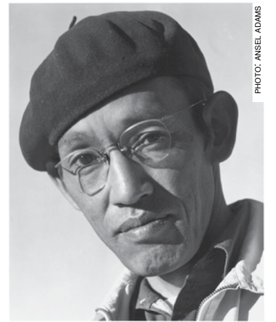
(Above) Toyo Miyatake, Photographer, 1943. Gelatin silver print (printed 1984). Private collection; courtesy of Photographic Traveling Exhibitions.