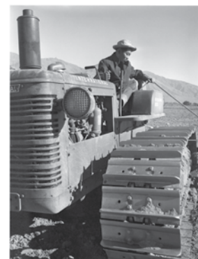
Benji Iguchi with tractor, 1943. Gelatin silver print (printed 1984). Private collection; courtesy of Photographic Traveling Exhibitions.

Lehtinen: Students will be coming to the exhibition to learn from and engage with the materials in the Skirball space. That was a big part of why we wanted to do