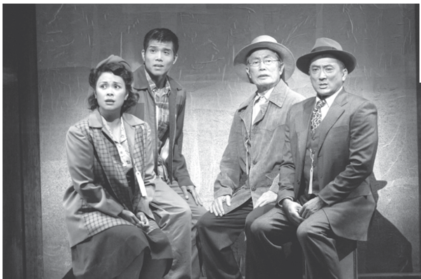
Performing "Allegiance" in San Diego were (from left) Lea Salonga, Telly Leung, George Takei and Paul Nakauchi.

In such a tumultuous period of time, the feelings of those affected and their positions on what the JACL could have or