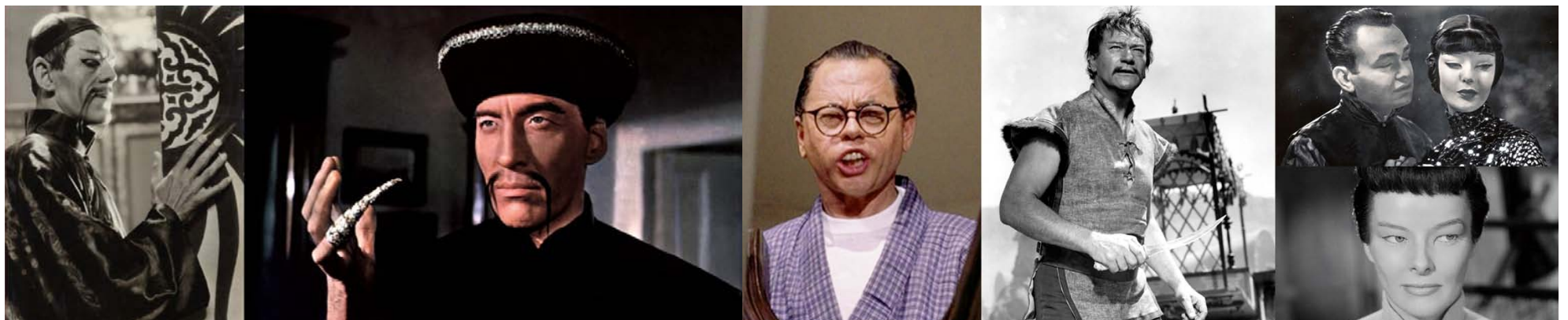
Yellowface in film, theater and television has long been a topic of discussion and controversy.

I hope that this can be a starting point for further dialogue on better inclusion of our community in Philadelphia theater, and perhaps a model for future advocacy around issues of representation in stage plays and theater productions. ■