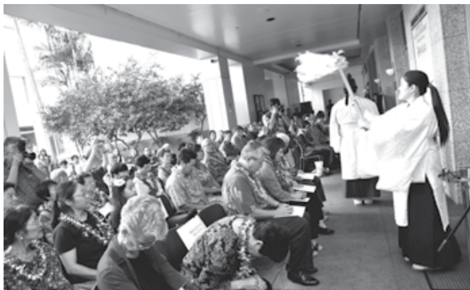
Shinto and Buddhist blessings were part of the official dedication ceremony of the Honouliuli National Monument — JCCH Education Center.