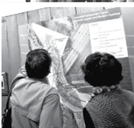
The new education center provides students, teachers and the community an opportunity to learn all about the Honouliuli National Monument.