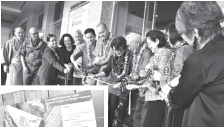
JCCH staff, National Park Service rangers, representatives from the Freeman Foundation, Monsanto Hawaii and JTB Hawaii, as well as elected Hawaiian government officials participated in the official ribbon-cutting ceremony to open the doors to the new education center.