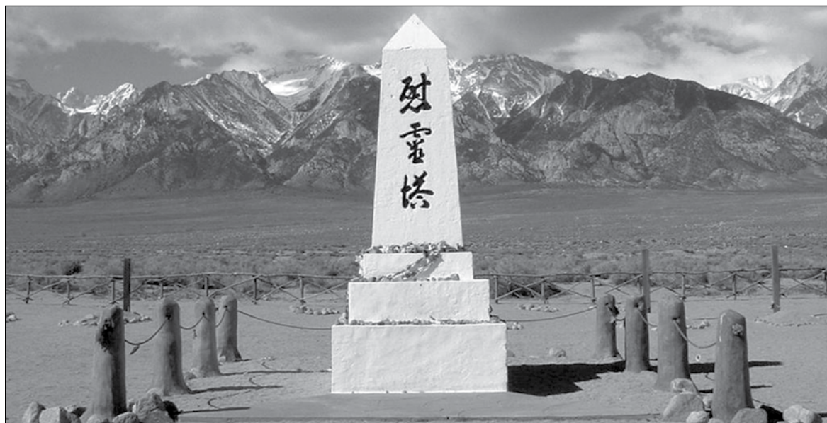
Manzanar is just one of ten confinement sites that has benefitted from the federal grants program.