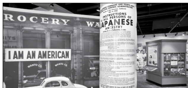
The Heart Mountain Interpretive Learning Center features many WWII memorabilia.

"They did not give up on their country that had so mistreated them," Brokaw said. "In so many ways, this symbol of failure now becomes a symbol of triumph and a light to show us the way forward." ■