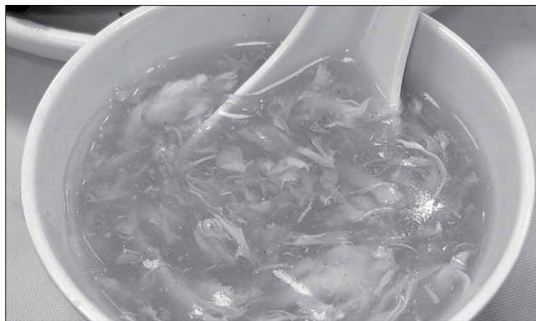
Shark fin soup is considered a delicacy in the Chinese culture

Some in the Chinese American community say the bill would discriminate against a cultural practice that has endured for centuries. Sen. Ted Lieu, D-San Francisco, said the bill is an attack on Asian cuisine and culture.