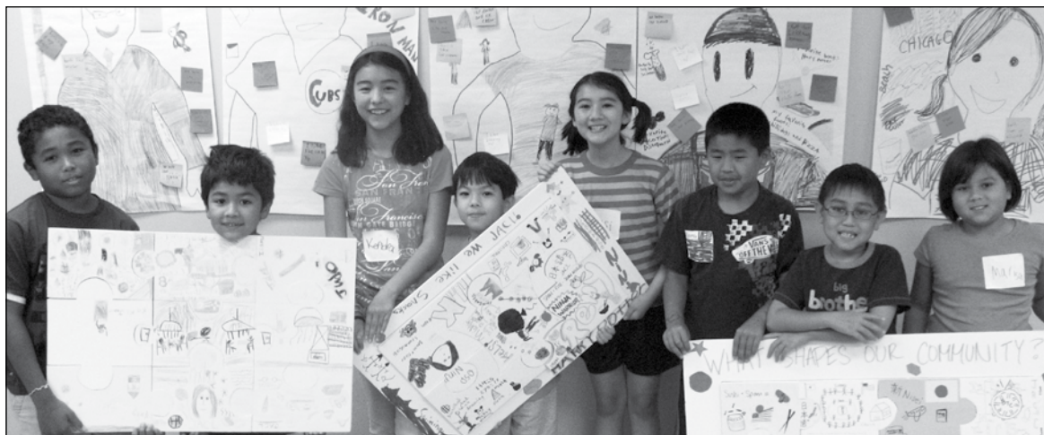
Campers spent time getting to know each other by drawing life-size portraits of themselves.