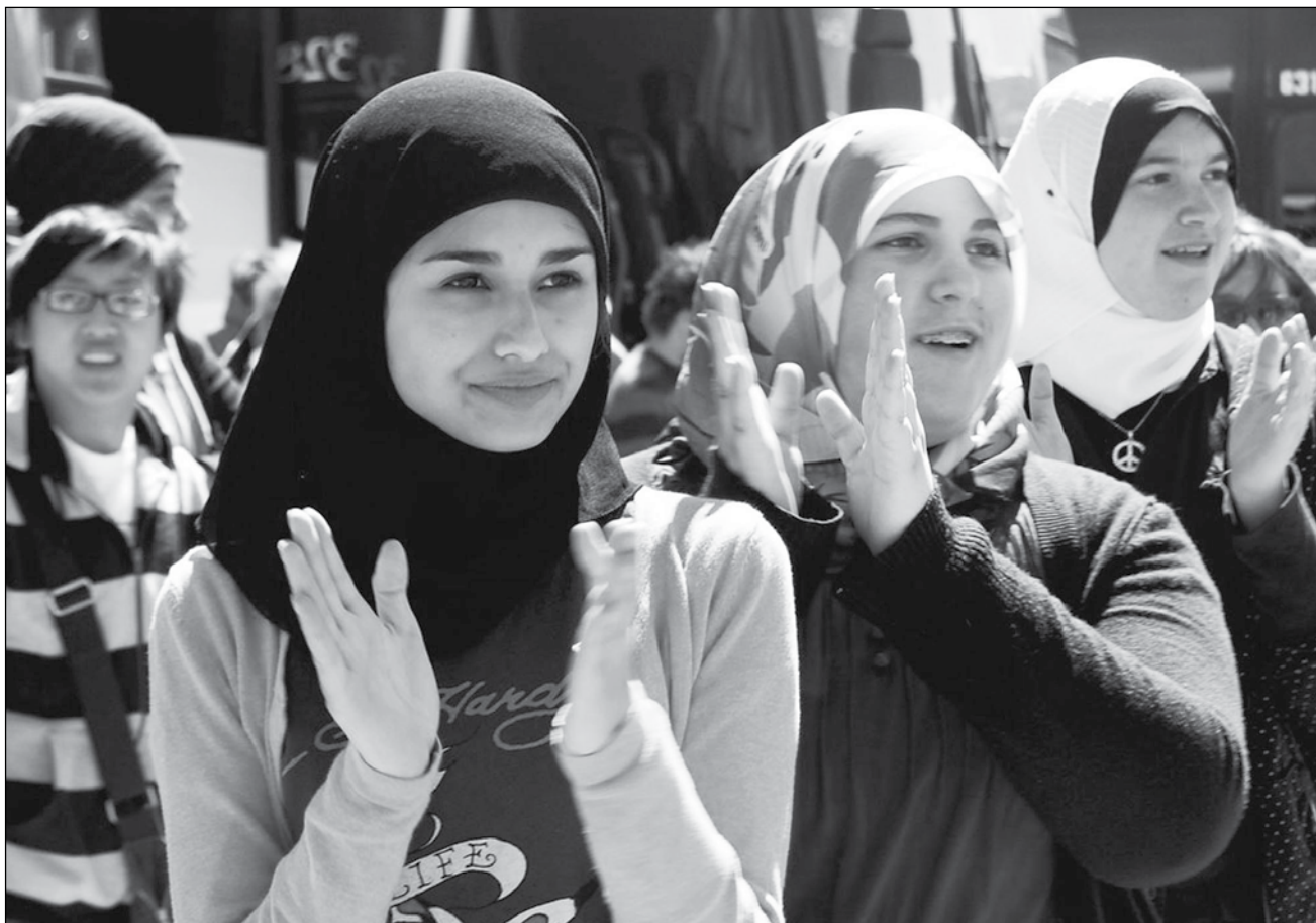
Muslim American youth visit Manzanar as part of the JACL’s Bridging Communities program.

“Once many of the participants go through the program,