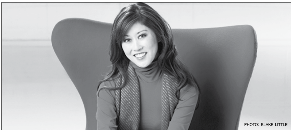
Olympic Gold Medalist Kristi Yamaguchi will attend the Oct. 1 awards ceremony.

A NATIONAL GUIDE TO NOTABLE COMMUNITY EVENTS