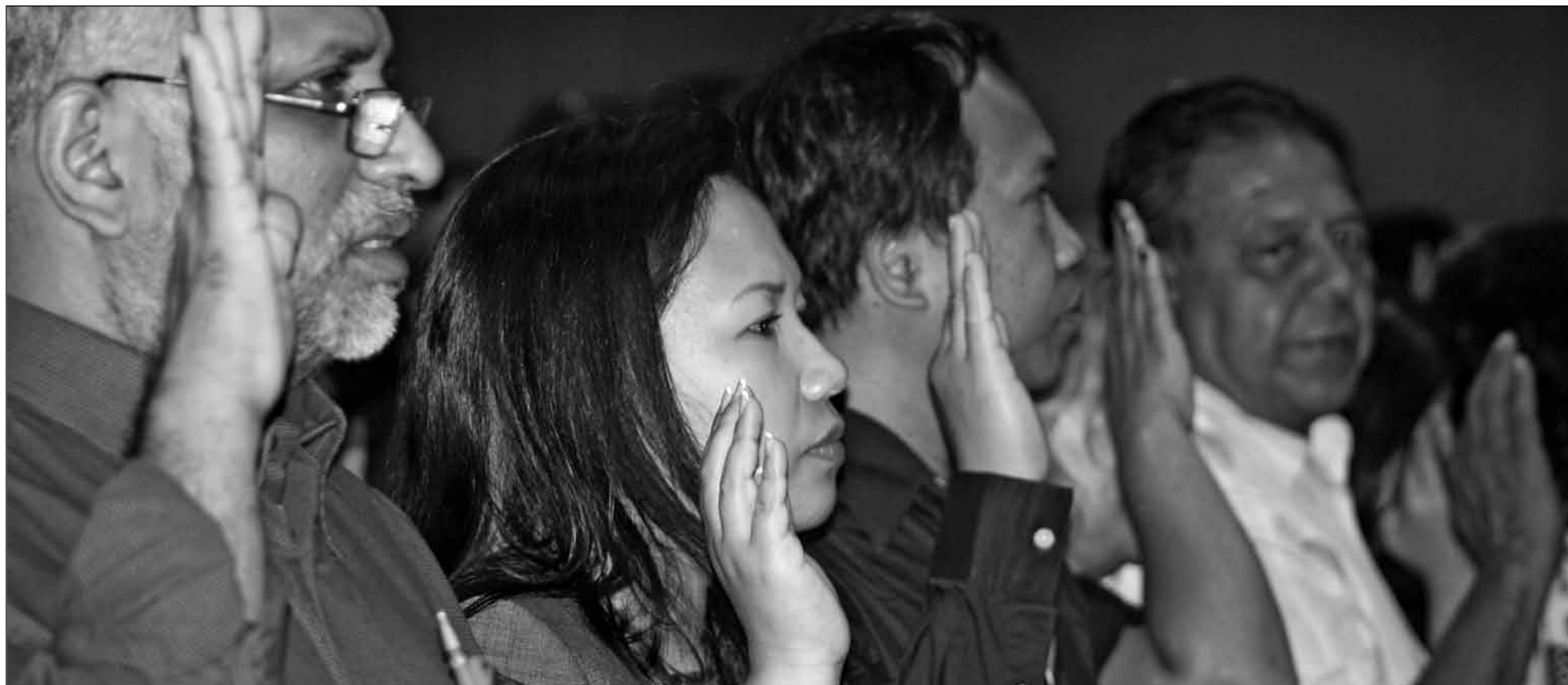
Asian Pacific Americans take part in a U.S. citizenship ceremony in Los Angeles Sept. 28.

Organizations like the Asian Pacific American Legal Center (APALC) are holding free citizenship workshops in California in an effort to help Asian Pacific Islanders become United States citizens.