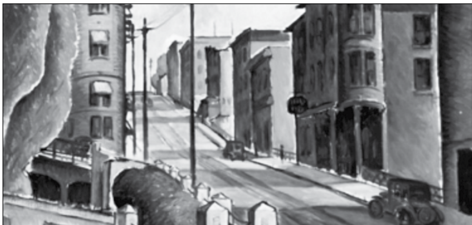
Kenjiro Nomura's painting "Street" will be among some of the paintings on display.

A NATIONAL GUIDE TO NOTABLE COMMUNITY EVENTS