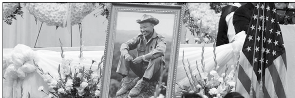
Thousands of mourners have traveled to Fresno to pay respect to the military leader.