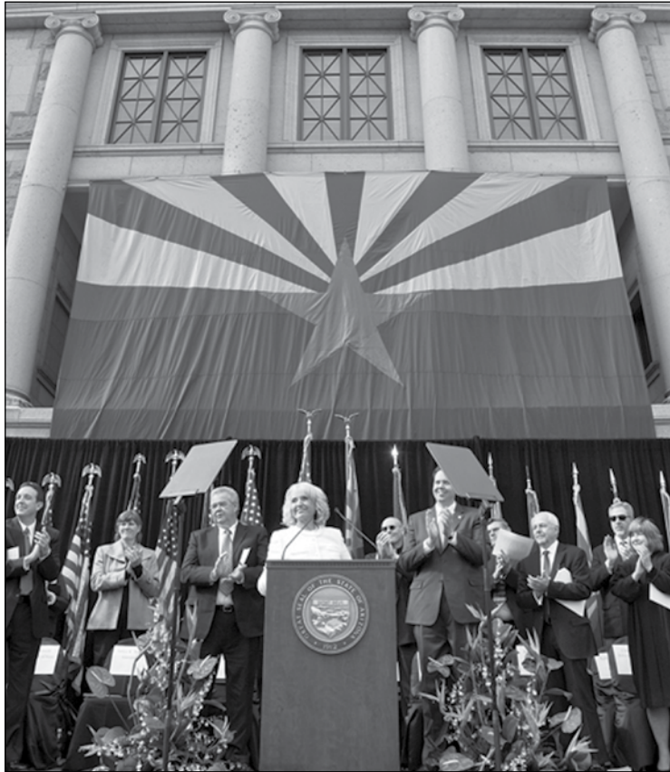
Governor Jan Brewer gave her Jan. 3 inaugural speech in front of the Arizona State Capitol.

“Arizona’s counterclaim against the United States is a political stunt designed to distract from the reality that SB 1070’s attempt to mandate racial profiling is unconstitutional,” said the Asian Pacific American Legal Center in a Feb. 10 statement. “Governor