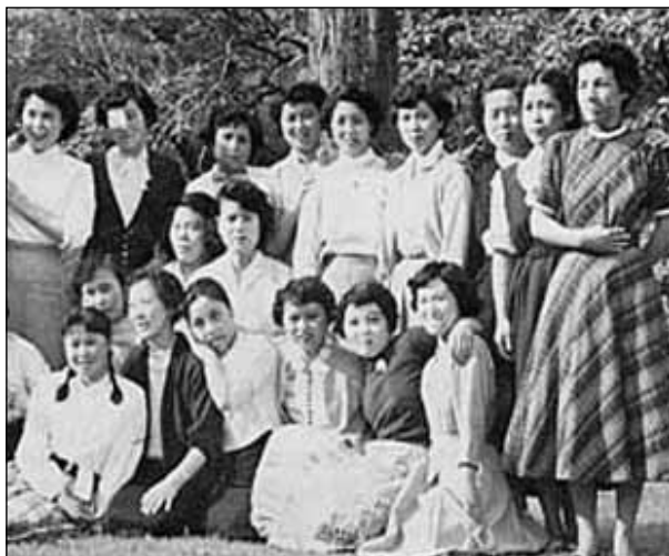
The 'Hiroshima Maidens' traveled to the U.S. in the 1950s for reconstructive surgery.