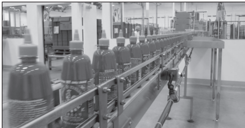
Sriracha sauce travels along the assembly line in preparation for shipment in Huy Fong Foods' new plant in Irwindale, Calif.