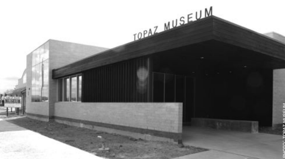
The Topaz Museum will use its Japanese American Confinement Sites grant to manufacture and install exhibits, making it possible to open to the public in 2015.